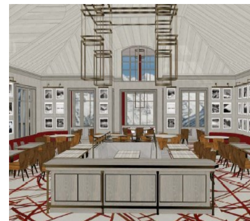
Aspen Mountain Club